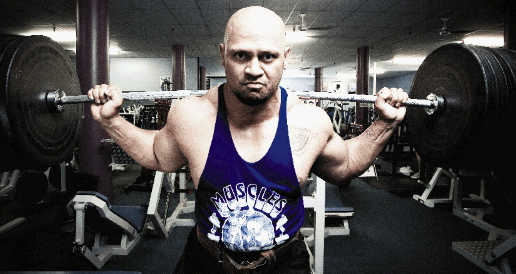
CLOCKWISE FROM ABOVE Boyer shoulders the weight of expectation; Q: How many Weet-Bix does he eat? For the answer, see pg 114; the ties that bind; leaving a mess on Bianca's belly; approx 30m in good old feet and inches.

Much has changed here in recent times. Hot asphalt has been ripped up for terrazzo tiles. Beachside 1960s-era units have been torn down, replaced by towers of white marble and green frosted glass. Takeaway shops have made way for mini-malls and shopping boutiques. Even the coffee is pretty good here. The prejudicial judgments that used to be made about "The GC" just don't wash any more. The place is on the up.